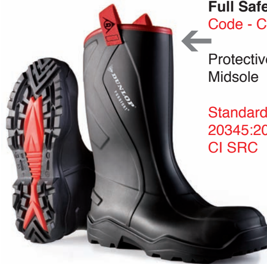
Purofort+ Rugged Full Safety Code - C762043.CH

Protective Toe & Midsole Standard - EN ISO 20345:2011 S5 CI SRC