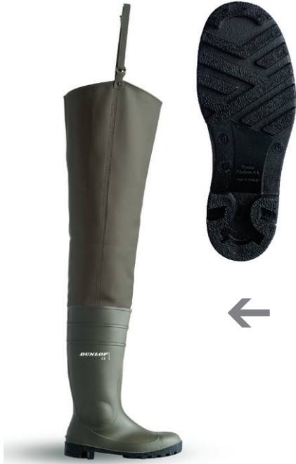
Protomaster Thigh Wader Full Safety Code - 142VP.PP