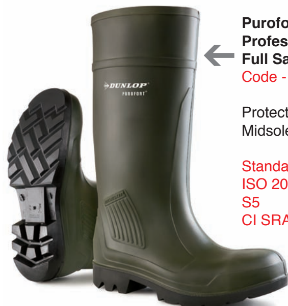
Purofort Professional Full Safety Code - C462933