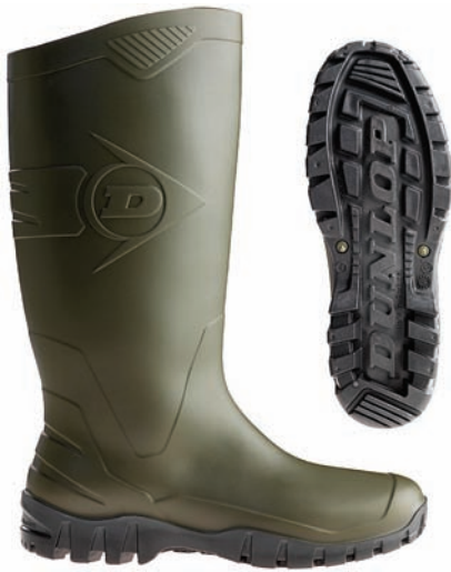
← Dunlop Dane SoftToe Code - K680211