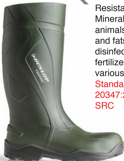
↓ Dunlop Wellie Shoe Code - B370411

Resistance - Minerals, animals and plant oils and fats, disinfectants, fertilizer, solvents and various chemicals Standard - EN ISO 20347:2012 O4 FO CI SRC