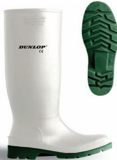
← Dunlop Pricemaster Code - 380BV

Resistance: minerals, animal and plant oils and fats, blood, disinfectants, fertilizer and various chemicals Standard - CE