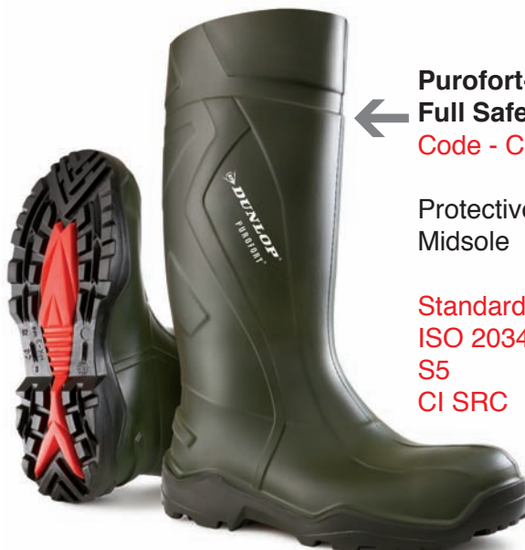
Purofort+ Full Safety Code - C762933