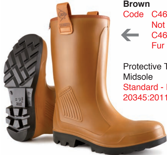
Purofort Rig Air Brown Code C462743 Not Fur Lined C462743.FL Fur Lined

Protective Toe & Midsole Standard - EN ISO 20345:2011 S5 CI SRC