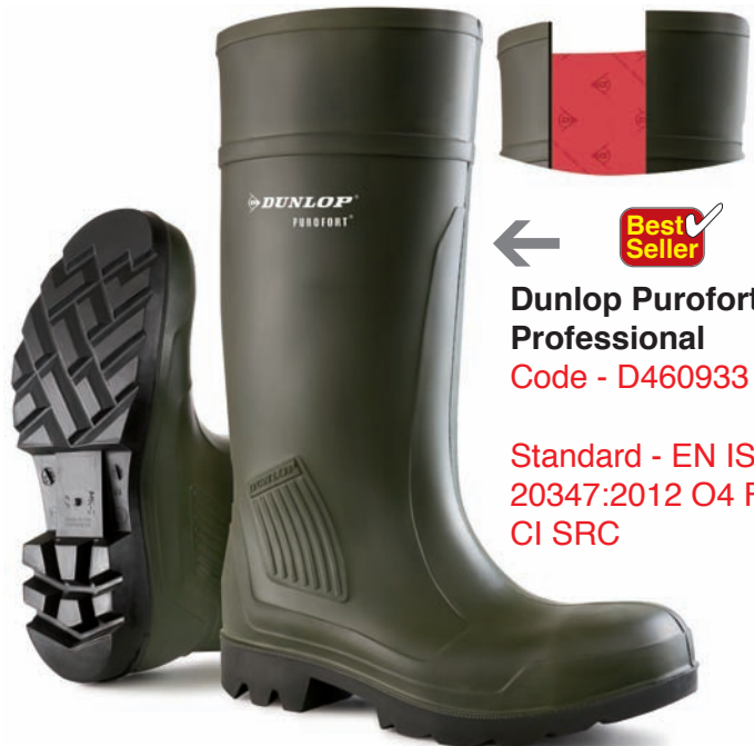
← Best Seller Dunlop Purofort Professional Code - D460933

Standard - EN ISO 20347:2012 O4 FO CI SRC